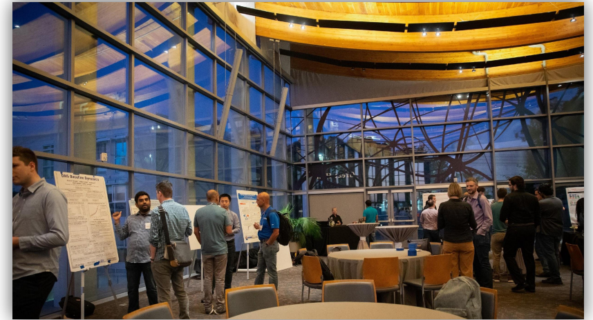
Poster session and reception at the CNS Research Review.

For CNS corporate membership, please contact us. cns@ucsd.edu .